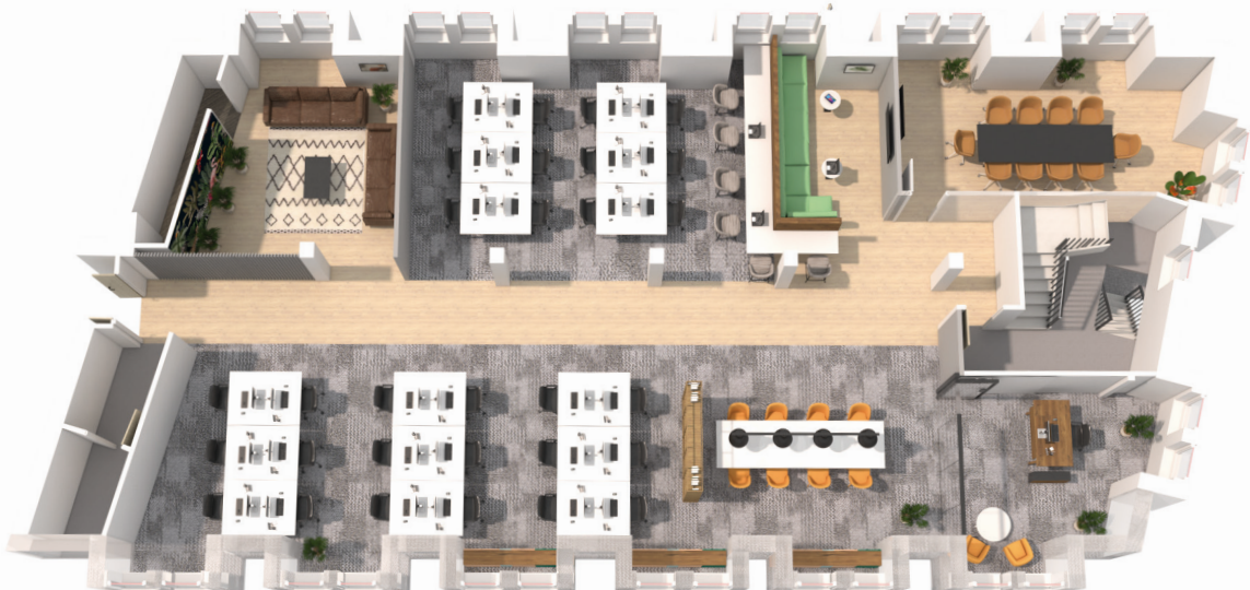
Indicative floor plan for the 1st Floor rear wing